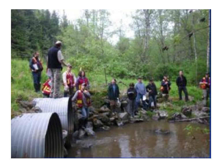
Figure 8. 2: Local experts participated in training and data collection for the pilot project.